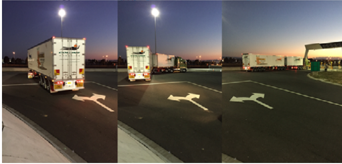
AutoTURN is an easy-to-use software solution

Swept path analysis examines the movement and path of a vehicle to determine the space requirements for vehicle turning manoeuvres. Making swept path analysis part of each phase of the design process can help avoid costly and time-consuming mistakes by ensuring designs safely and efficiently accommodate vehicle movements.