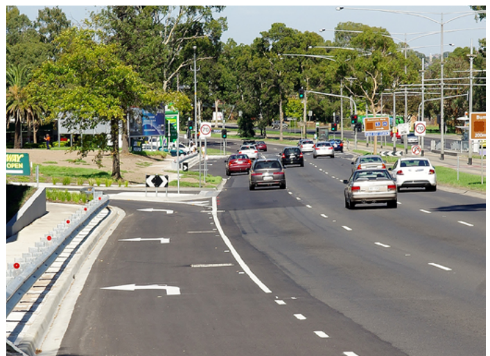
Swept path analysis helps avoid costly mistakes

Transoft prides itself on continually improving product features. On a quarterly basis, Transoft updates its extensive libraries of more than 300 manufacturer-based vehicles so customers like Cardno can generate turning simulations they require.